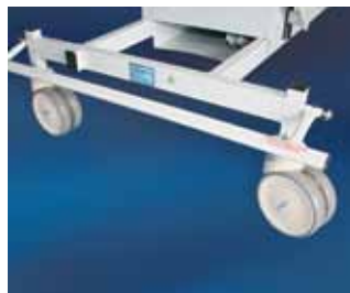
Single action central locking