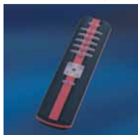
Cordless remote hand control (Infrared)