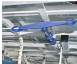
IV pole under bed storage