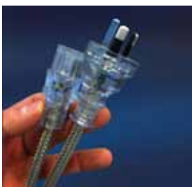
Steel braided anti flex coating on mains cable