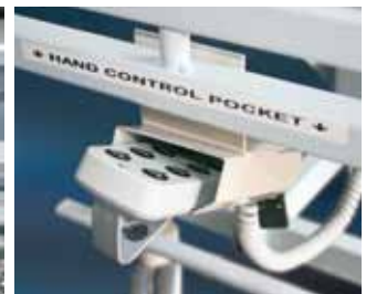
Optional hand control storage