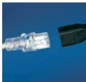
Break away cable