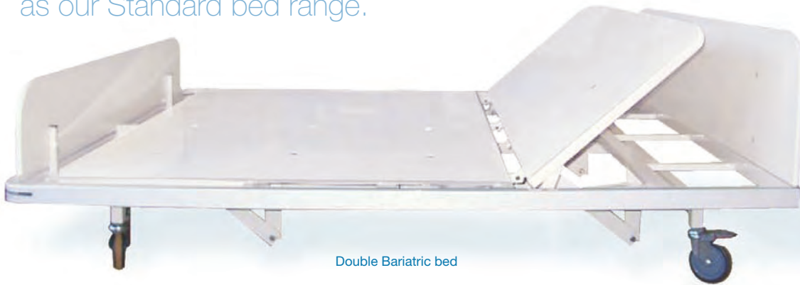
Double Bariatric bed

Our range of bariatric beds enjoys the same features and optional extras as our Standard bed range.