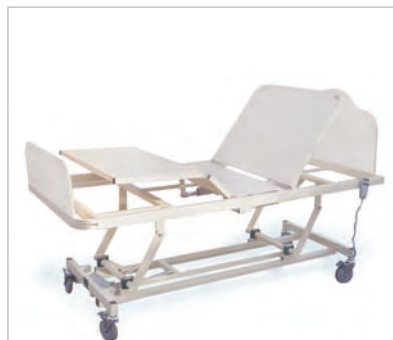
King Single Bariatric bed