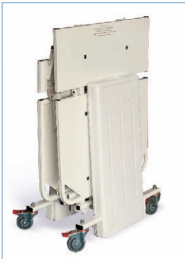
Optional folding feature