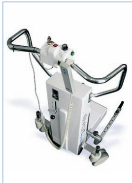
Evo bed mover now available to suit our range of SafeCare and Standard beds.